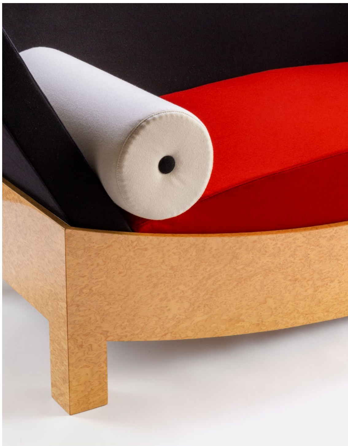
the sofa witness and portrait of a decade