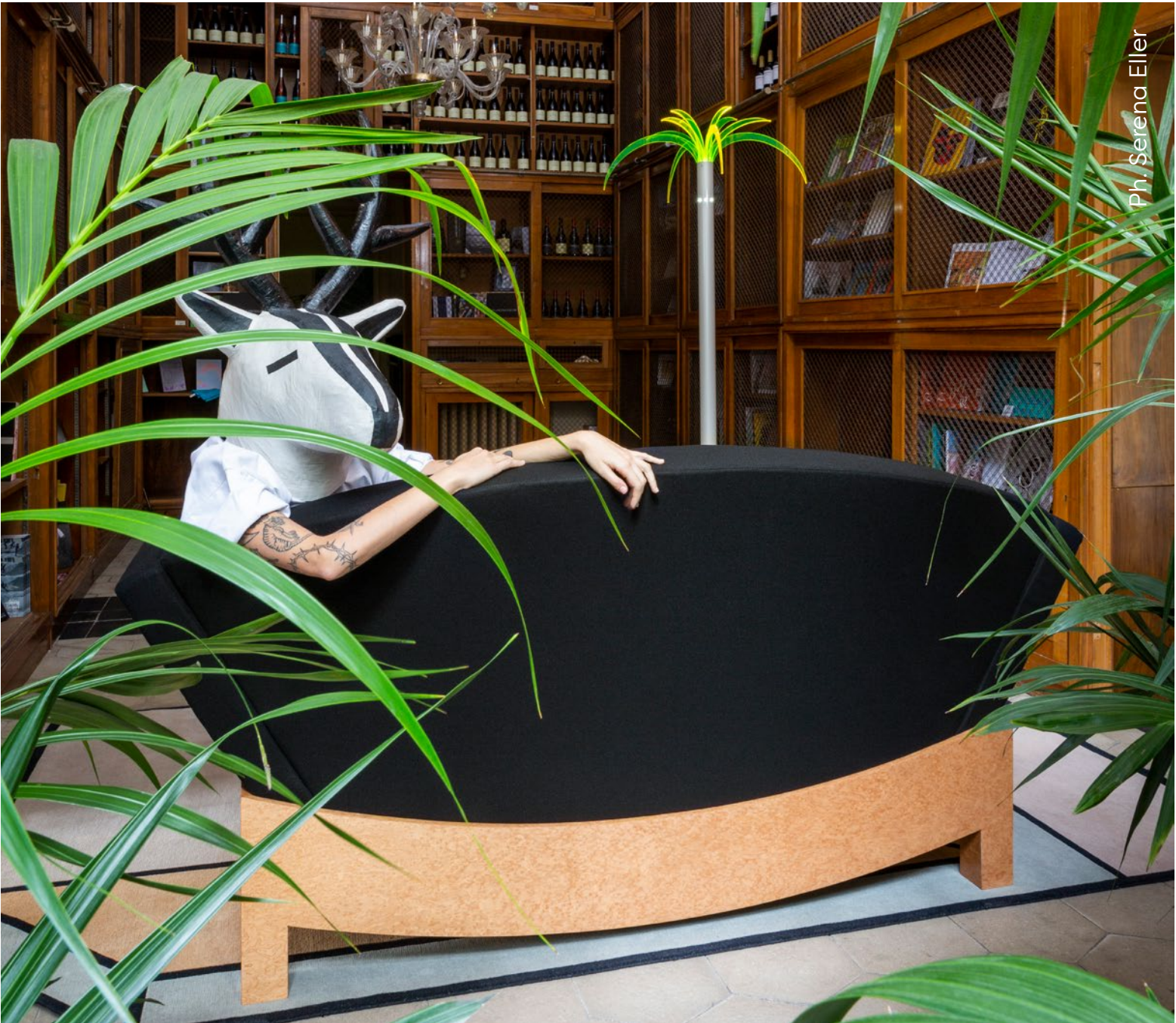
↗ Contemporary Cluster, Palazzo Brancaccio, Rome. 2021