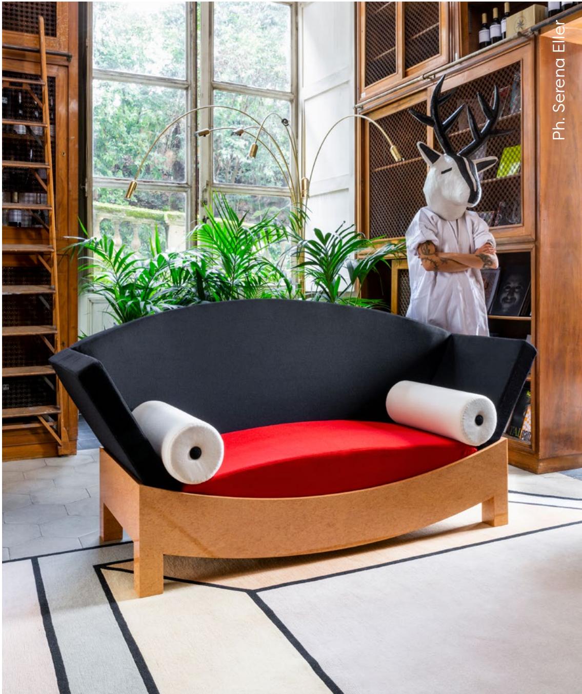
↗ Contemporary Cluster, Palazzo Brancaccio, Rome. 2021