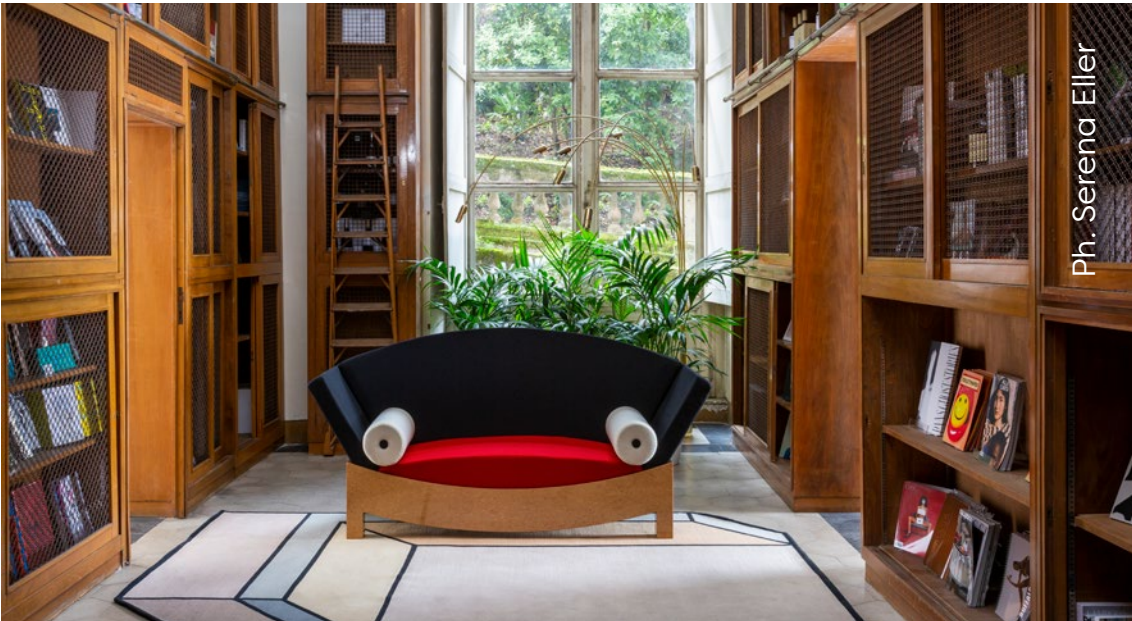
↗ Contemporary Cluster, Palazzo Brancaccio, Rome. 2021