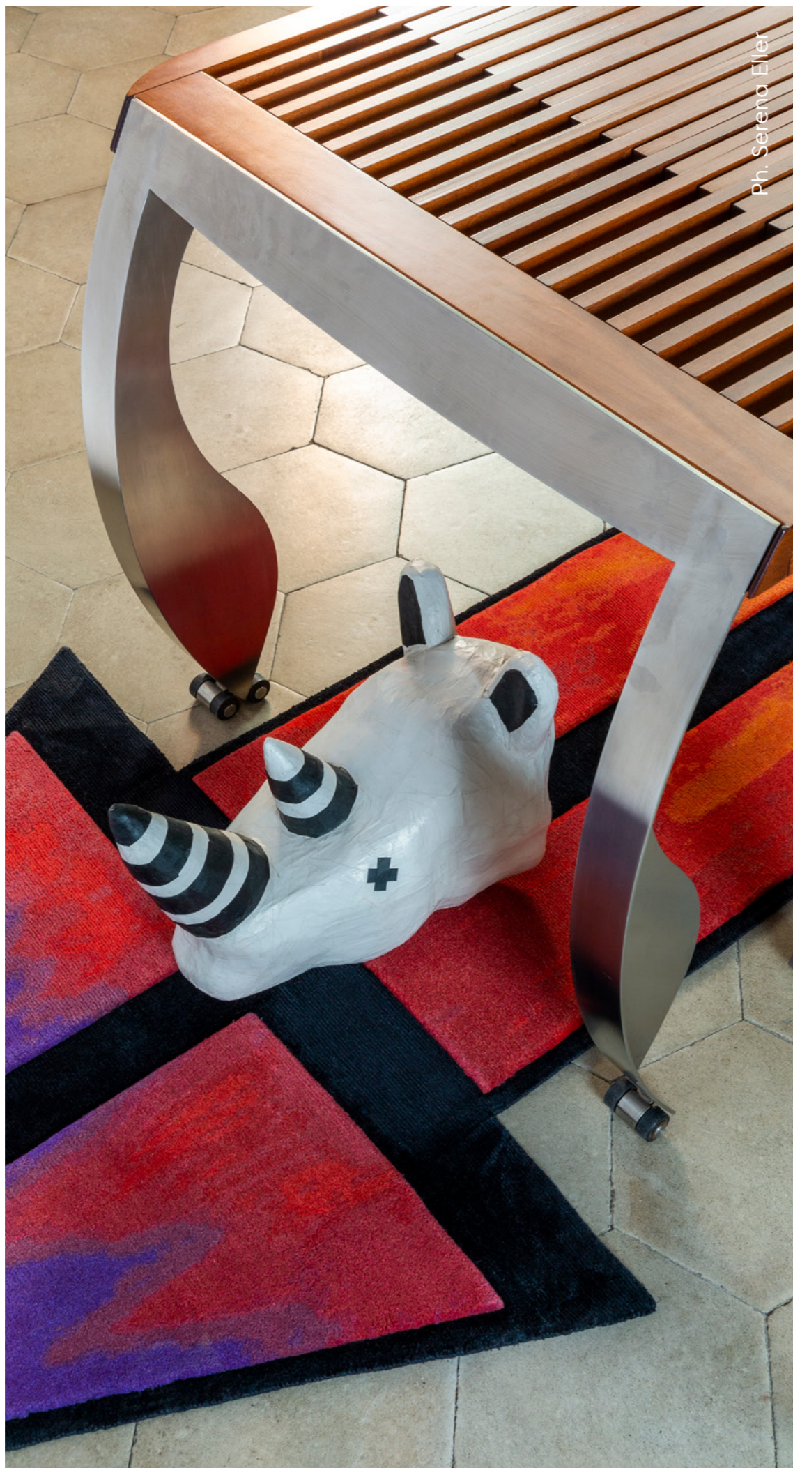
↖ Africano, Cluster Palazzo Brancaccio, Rome. 2021