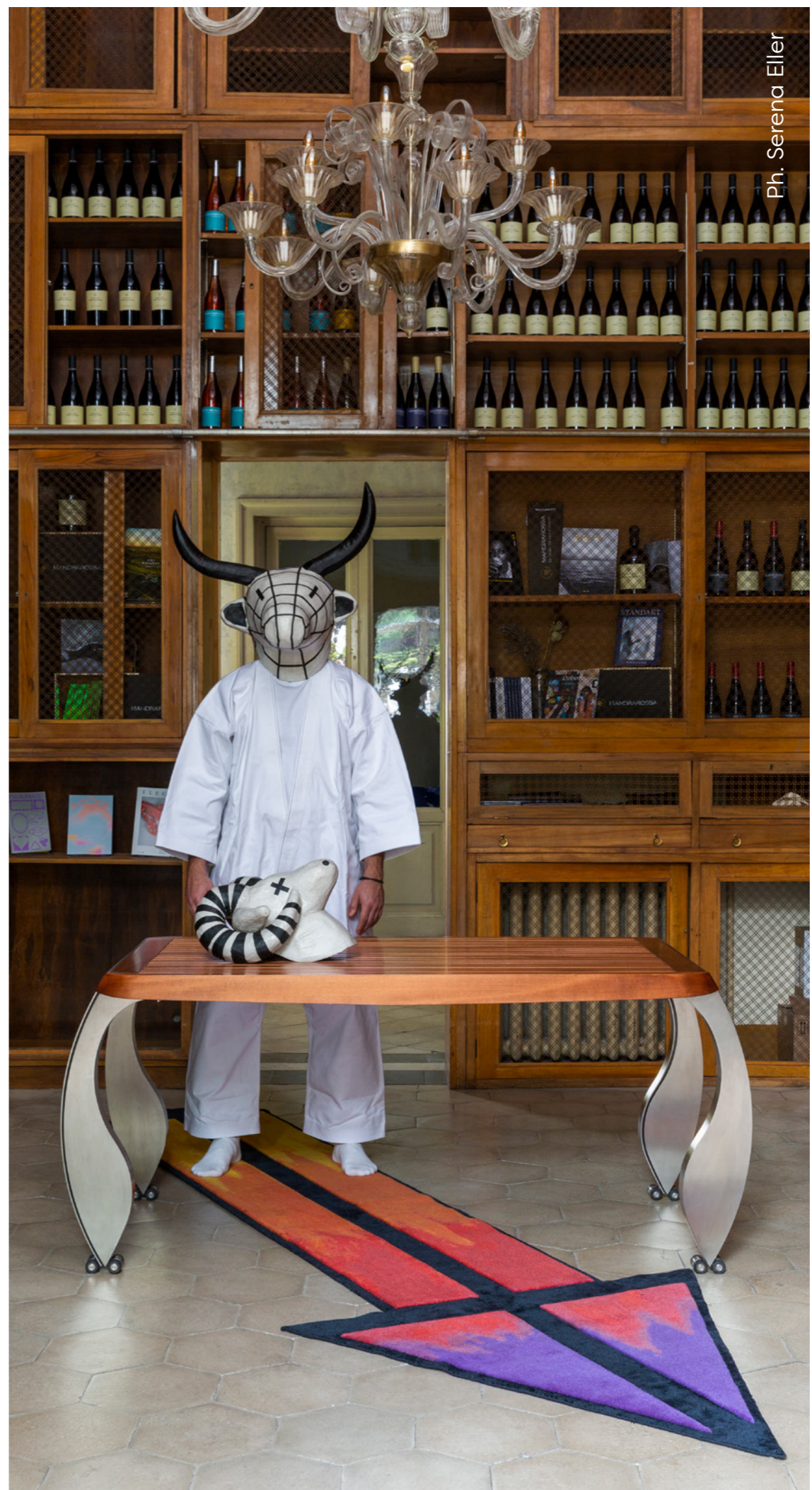
↖ Africano, Cluster Palazzo Brancaccio, Rome. 2021