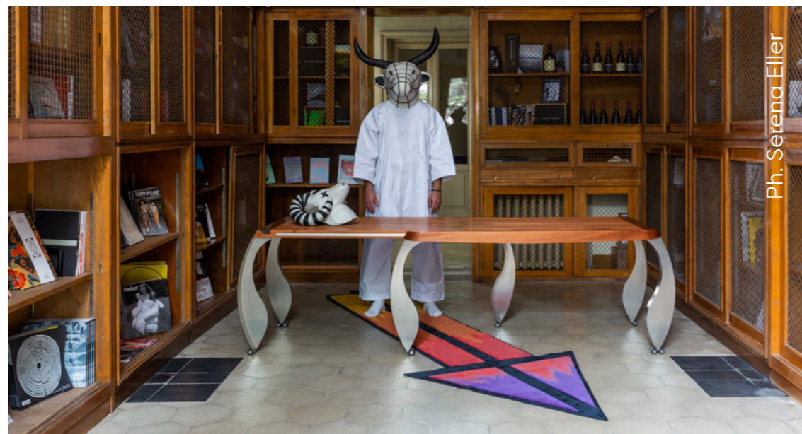
↖ Africano, Cluster Palazzo Brancaccio, Rome. 2021